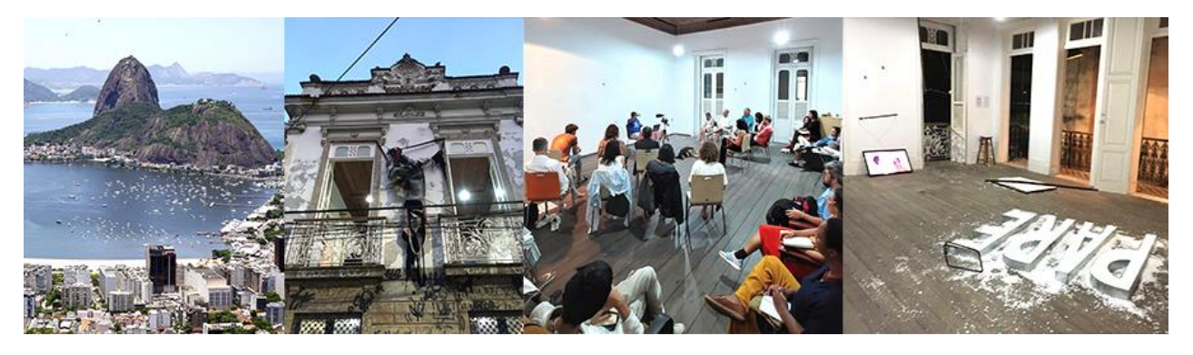
Rio's Sugarloaf Mountain